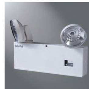
B BUDGET EMERGENCY LIGHT